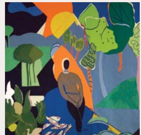
Romare Bearden, Recollection Pond

Home to Jazz greats Billy Holiday and Count Basie, there is an abundance of cultural and entertainment offerings in Jamaica. The Downtown boasts two major performing arts centers located on or very near Jamaica Avenue including the Jamaica Performing Arts Center. Completed in 2008, the $22M 400-seat venue is set to become the premier destination for first class events in the region. This is in addition to the "Broadway equipped", 2100-seat York College Performing Arts Center, located just blocks away. Other attractions include the Rufus King Historic House Museum, the Central Branch of the Queens Library, and a new 12 screen movie theatre located in the heart of the Downtown area.